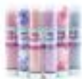
Text Tube Body Care