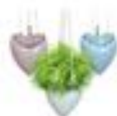
Ceramic Plant Hanger