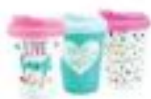
Themed Travel Mug