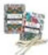
Adult Colouring Set