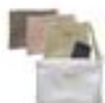
Carry All pouch