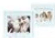
Love & Family Photo Frame