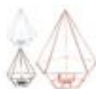
Prism Tea Light Holder