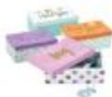
Wooden Trinket Box