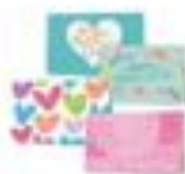
Small Gift Cards