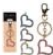
Glamorous Key Ring